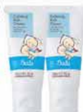
Buds Soothing Organics Calming Rub Cream 30ml