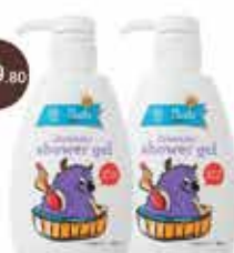
Buds For Kids Lavender Shower Gel 350ml