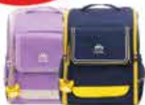
Japanese Style Backpack

Morinaga Chil-Kid with purchase of 8 Boxes 700g or 6 Tins 900g