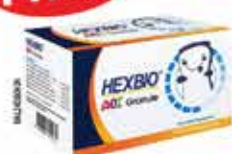
Hexbio Aoi Gran 60sacx1.5g

Hexbio Gran 45s with purchase of any 2 boxes