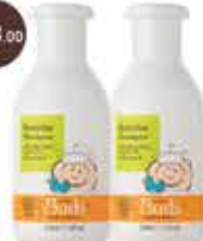
Buds Everyday Organics Everyday Shampoo 225ml