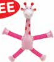
Stretch Tube Toy

Mk Essentia Silky Baby Range with purchase any 1 bottle