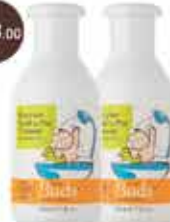
Buds Everyday Organics Everyday Head to Toe Cleanser 225ml