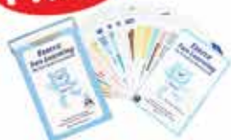
Fun Learning Card

Ezerra Range with purchase of any 2 units