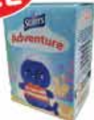
Scotty Blind box

Scott's Range with purchase of RM38 & above