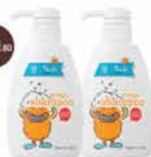
Buds For Kids Orange Shampoo 350ml