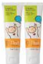
Buds Everyday Organics Everyday Baby Cream 75ml