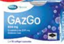
Bio-life Gazgo Sample 10's

Bio-Life GazGo 200 (1x10 sgel) with purchase any 2 boxes