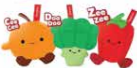
Blind Box Plushie Toy

Redoxon Range with purchase of RM60 & above