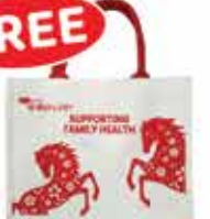
Exclusive Horse Year Trendy Bag

Bio-Life Range with purchase of RM288 & above