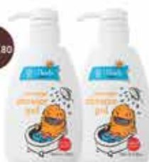
Buds For Kids Orange Shower Gel 350ml