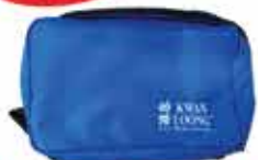
Kwan Loong Toiletries Bag

Kwan Loong Range with purchase of RM15 & above