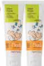
Buds Everyday Organics Infant Cream 75ml