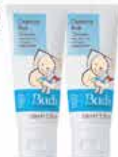
Buds Soothing Organics Calming Rub Cream 50ml