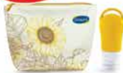
Cetaphil Pouch + Silicone Bottle

Cetaphil Range with purchase of RM88 & above