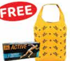
Foldable Bag / Activ Muscle Gel

Tiger Balm Range with purchase of RM30 / RM38 & above