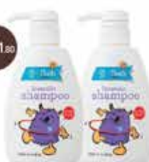
Buds For Kids Lavender Shampoo 350ml