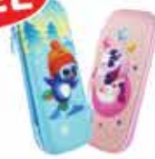
Kids Pencil Box

Jordan Range with purchase of RM28 & above